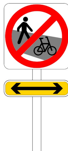
SIGNS PROHIBITING CROSSING OF ROAD ON EITHER SIDE OF A PEDESTRIAN CROSSING