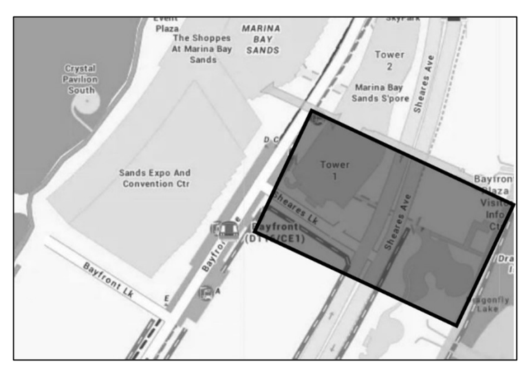
MAP 2: PROMENADE