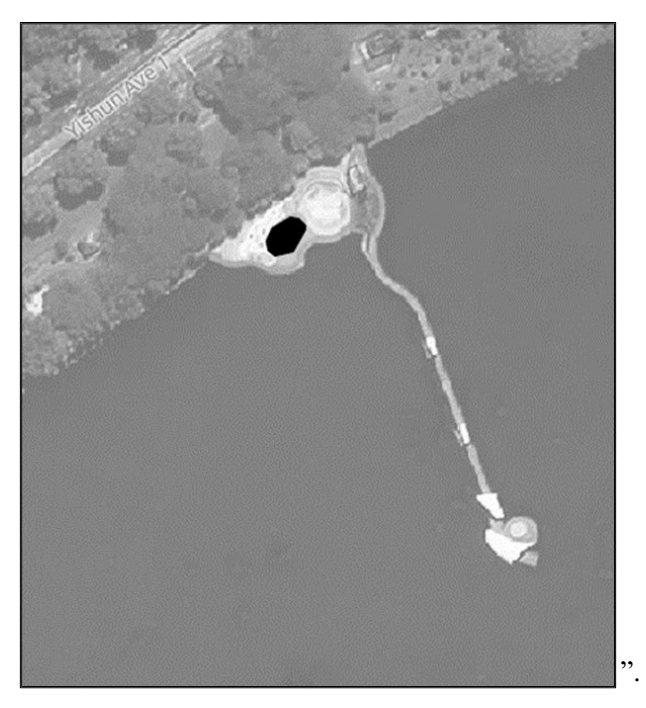
[G.N. Nos. S 462/2019; S 183/2020; S 741/2020; S 925/2020; S 576/2021; S 108/2022; S 598/2022]

1. The path-connected open space in the Family Bay Area of the Lower Seletar Reservoir Park that is shaded in black colour in the map set out below.