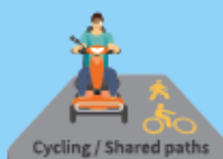
Cycling / Shared paths