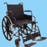
Manual Wheelchair (Non-motorised)

Devices which are designed to carry an individual who has difficulty walking.