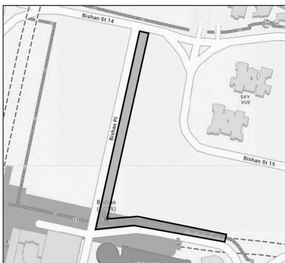
MAP 1: BISHAN – JUNCTION 8