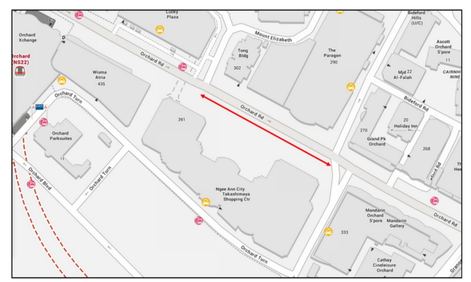
Made on 16 September 2019.