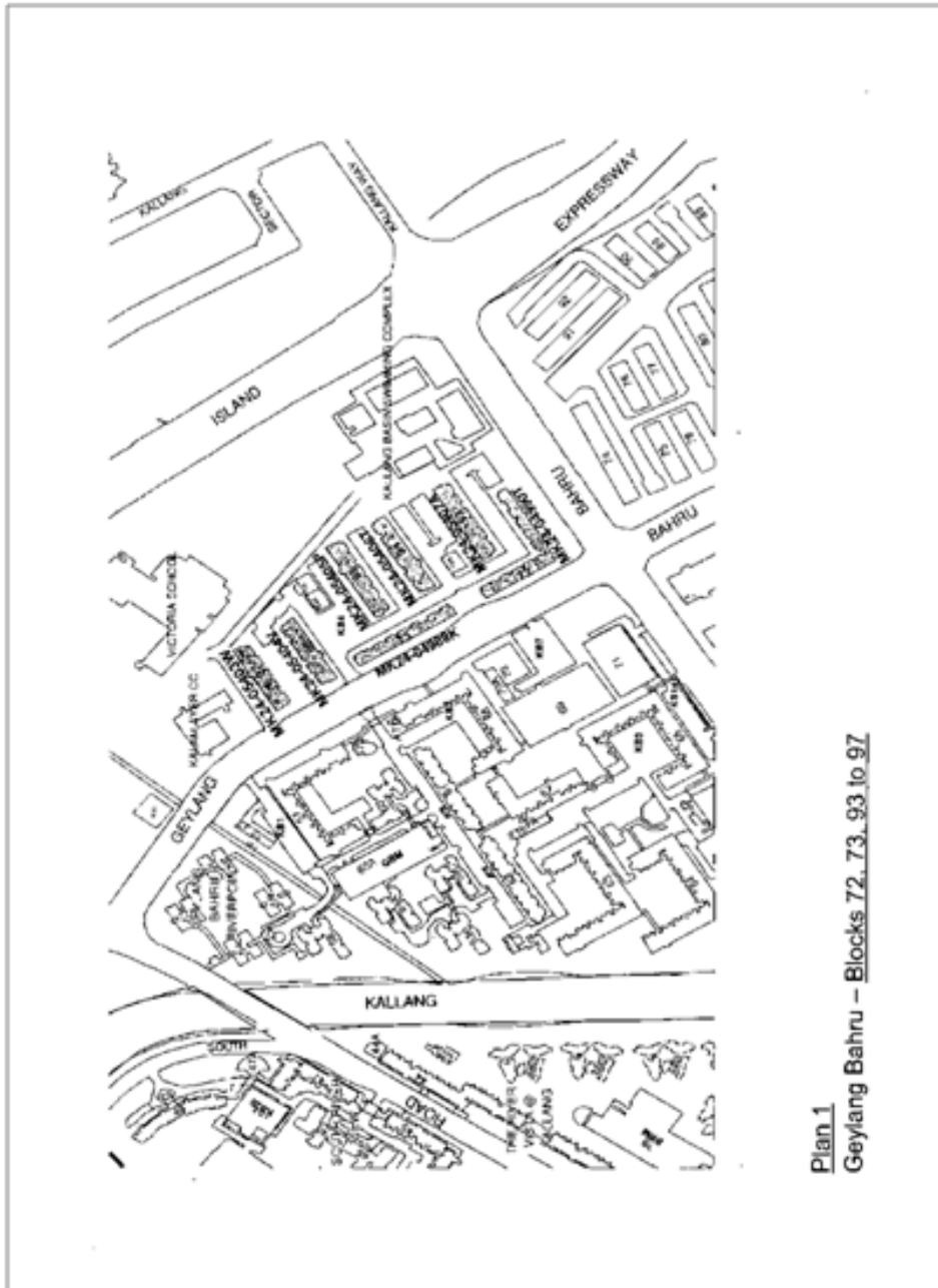
Plan 1 Geylang Bahru - Blocks 72, 73, 93 to 97