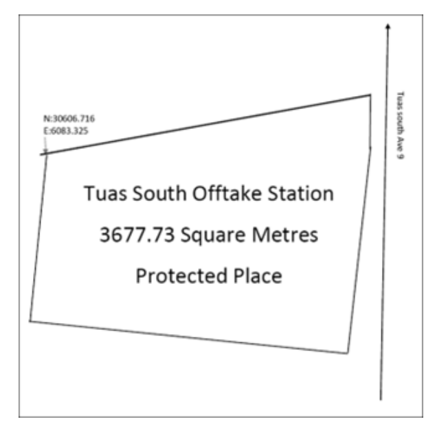
[S 98/2023 wef 24/02/2023]

The boundaries of "Tuas South Offtake Station" are more particularly delineated in the Survey Plan set out below.