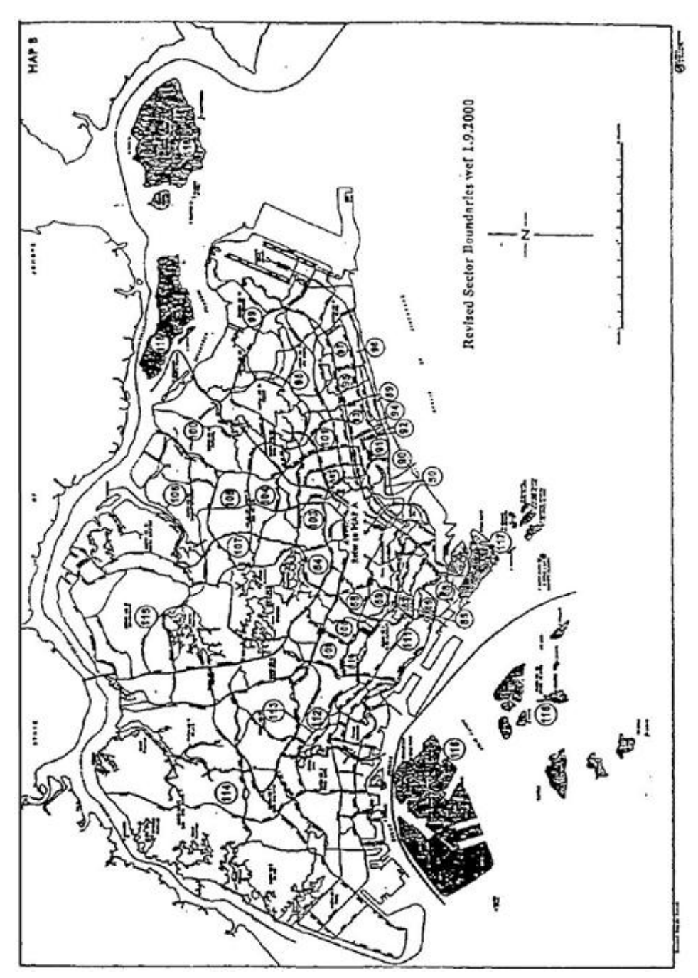
[S 421/2008 wef 01/09/2008]