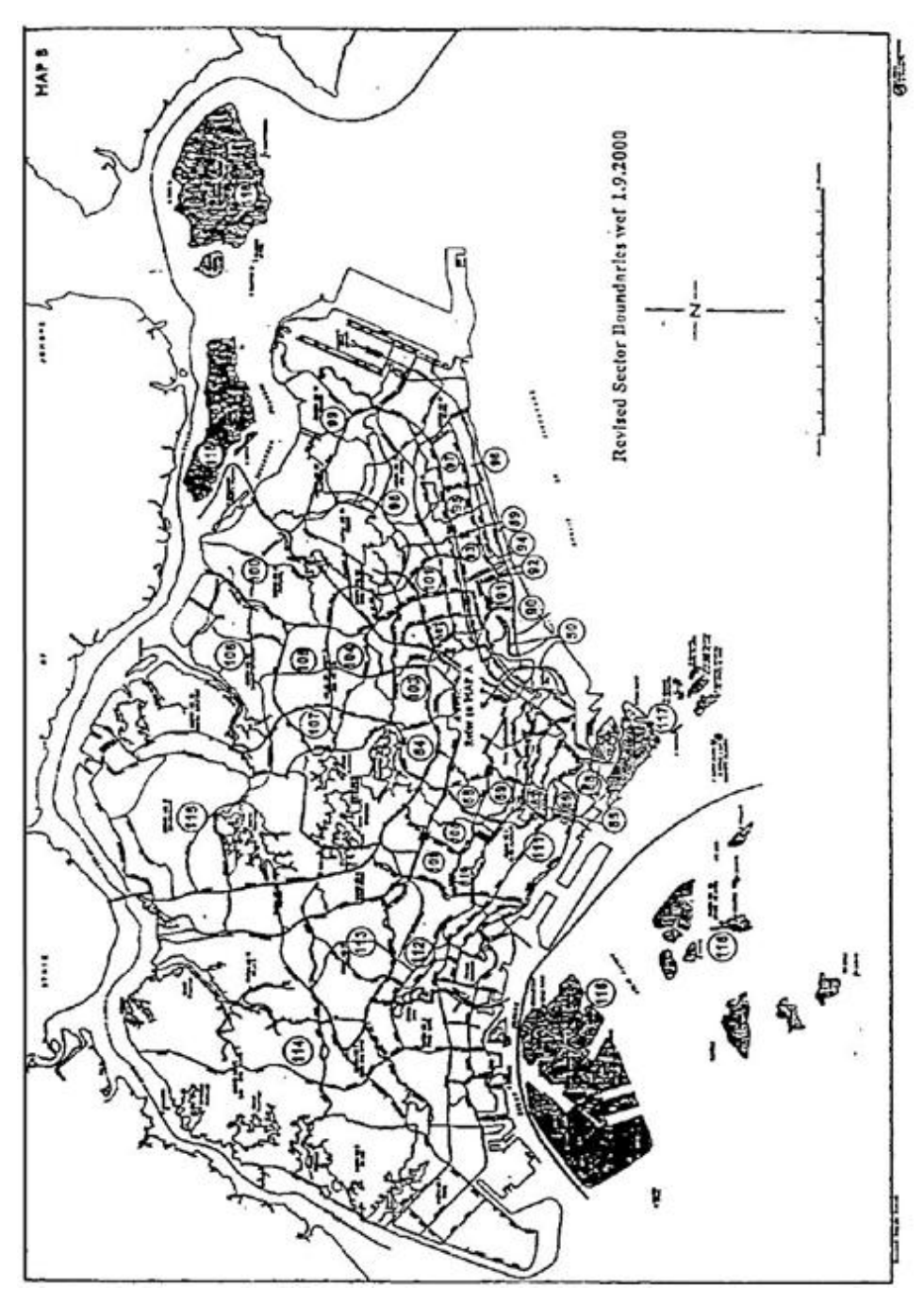
[S 421/2008 wef 01/09/2008]