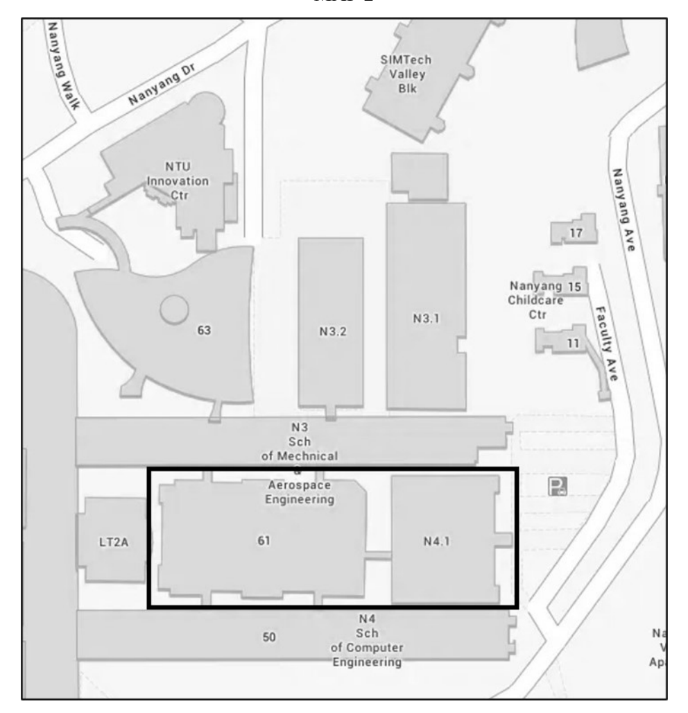
THE SCHEDULE — continued MAP 2