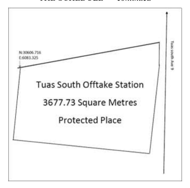
THE SCHEDULE — continued